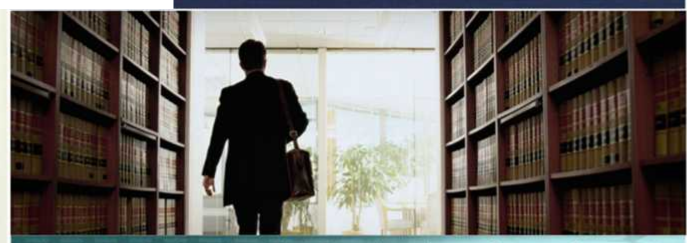
Let the Professionals at EquiCorp Associates take over the matter